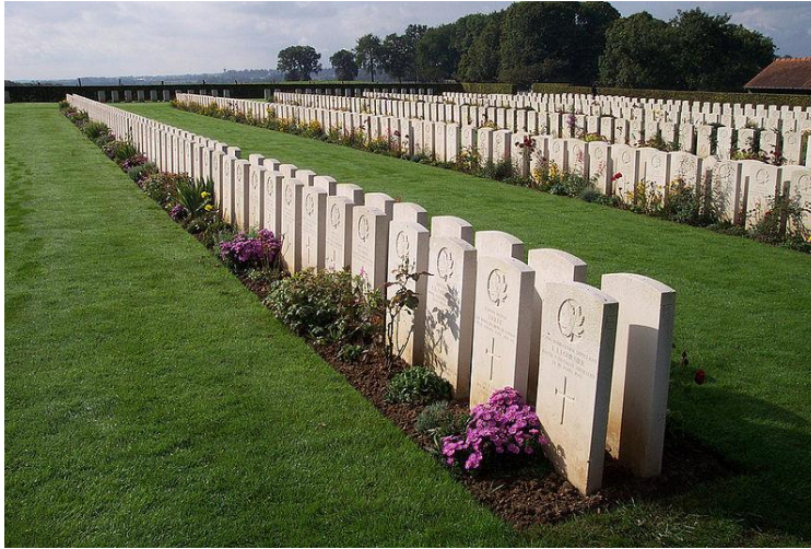
Dieppe Canadian War Cemetery

Pauwels Travel Bureau Ltd. 55 Dufferin Ave. Brantford, Ontario. N3T 4P6 TEL: (519) 753- 2695, FAX: (519) 753- 6376 tours@pauwelstravel.com - www.pauwelstravel.com