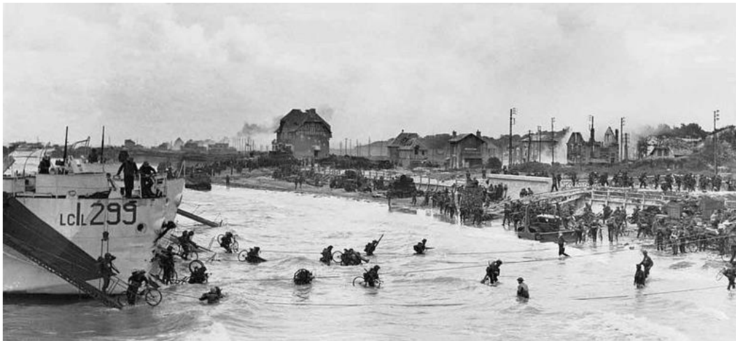
Canadian troops disembarking at Bernières - Juno Beach.

Two full days of sightseeing in Normandy. Highlights will include Pegasus Bridge; Juno Beach (the Canadian sector of the Landing Beaches) with the excellent Juno Beach Centre in Courseulles-sur-Mer; the Canadian War Cemetery of Bény-sur-Mer; Arromanches with the remains of the great artificial 'Mulberry' harbour; and Ardenne Abbey, where Canadian POWs were executed by SS troops. Also Bretteville Canadian War Cemetery in the area of the Falaise Gap; Caen, the city of William the Conqueror, carefully rebuilt after being destroyed during the fighting in 1944; and the picturesque town of Bayeux, famous for the "Bayeux Tapestry," a medieval embroidered "comic strip" showing the conquest of England by William, Duke of Normandy. Late afternoon return to Honfleur and free evening.